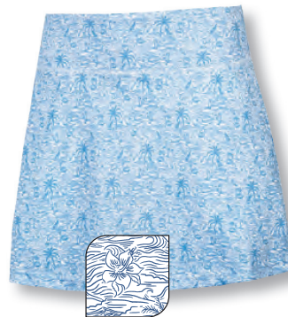
4 | 39447 white/coastal blue logo _____

Fabric: 88% recycled polyester, 12% elastane Size: XS-XL