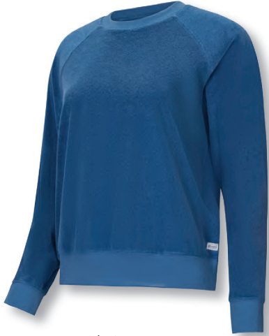
1 | 39444 ocean blue logo _____

Fabric: 79% organic cotton, 21% recycled polyester Size: XS-XL