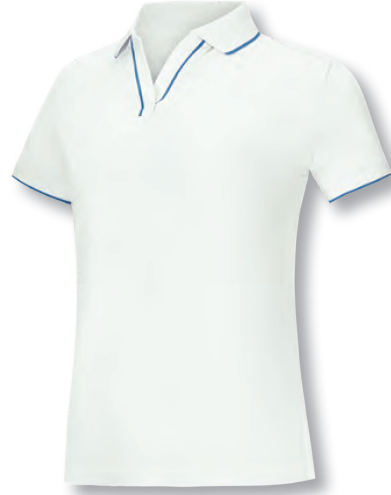
2 | 39445 white logo _____

Fabric: 90% recycled polyester, 10% elastane Size: XS-XL