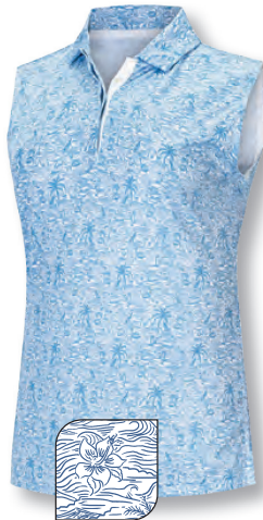
3 | 39446 white/coastal blue logo _____

Fabric: 88% recycled polyester, 12% elastane Size: XS-XL