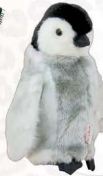
Baby Emperor Penguin