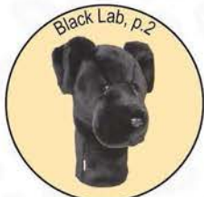
Black Lab, p.2