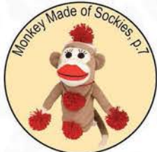
Monkey Made of Sockies, p.7