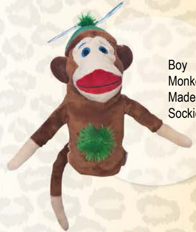
Boy Monkey Made of Socksies