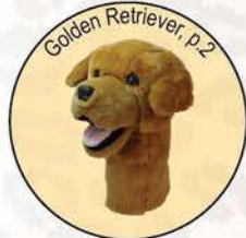
Golden Retriever, p.2