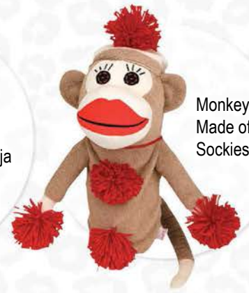
Monkey Made of Sockies