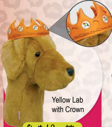
Yellow Lab with Crown