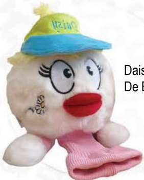
Daisy De Ball