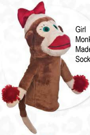
Girl Monkey Made of Socksies