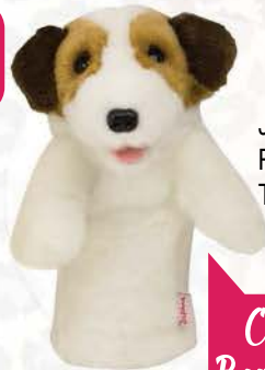
Jack Russell Terrier